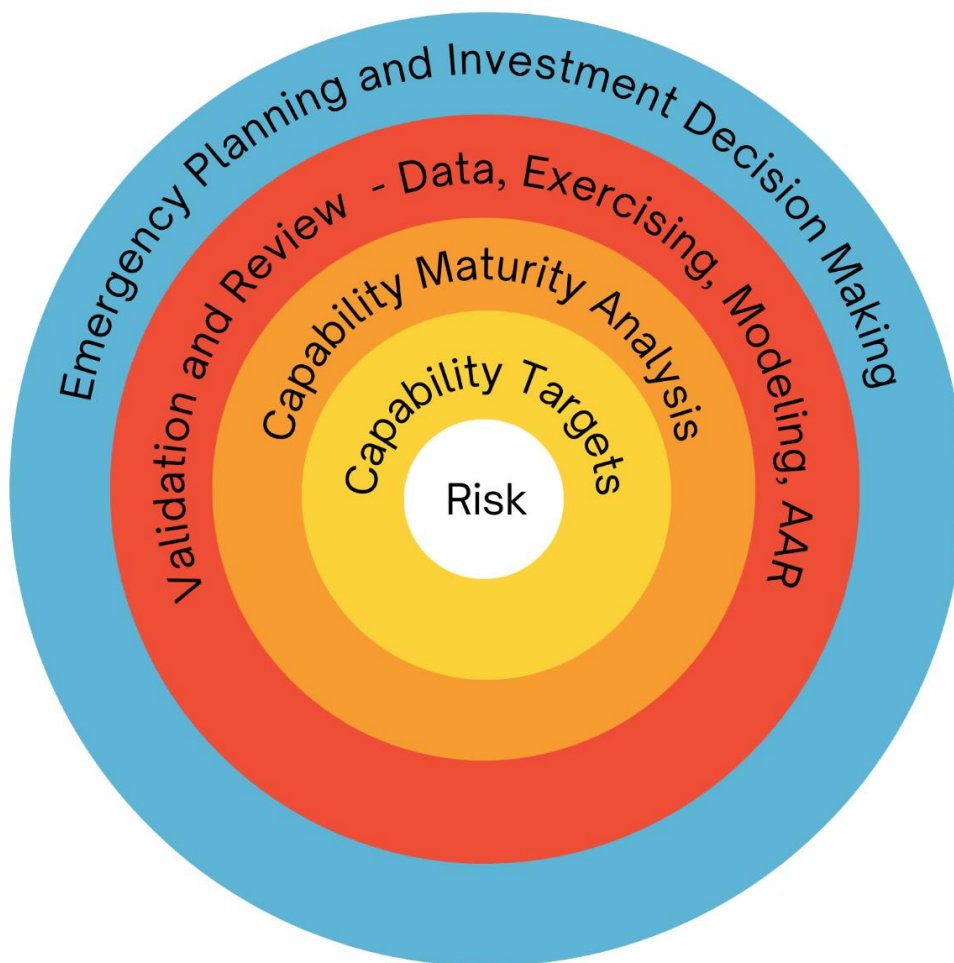
FIGURE 4: SUGGESTED APPROACH.