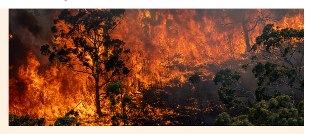
A Above: BUSHFIRE RAGING AT THE NORTH BLACK RANGE IN NSW, DECEMBER 2019.

The 2019/20 bushfire season was unprecedented in NSW, with destructive bushfires occurring across the state between August 2019 and February 2020. Tens of thousands of people were displaced by the fires, including residents, tourists and visitors to affected areas, with many fires occurring during the Christmas and New Year holiday period. Tragically, 26 people lost their lives in the fires. Many more people were affected by smoke in both metropolitan and regional areas. By season's end, bushfires had burned a record 5.5 million hectares of NSW and destroyed 2,448 homes (NSW RFS 2020). The fires adversely affected many industries, including agriculture, forestry and tourism.